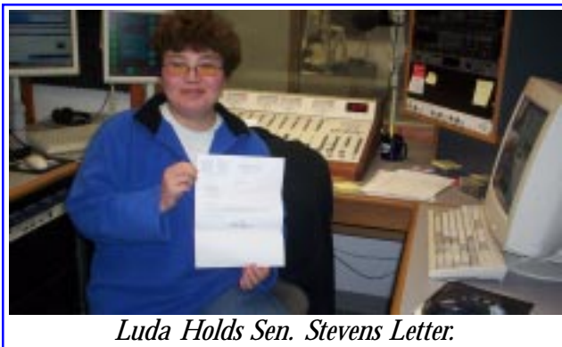
Luda Holds Sen. Stevens Letter.