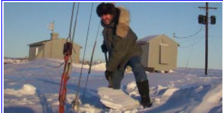
Shoveling the Snow From the Guy Anchors.